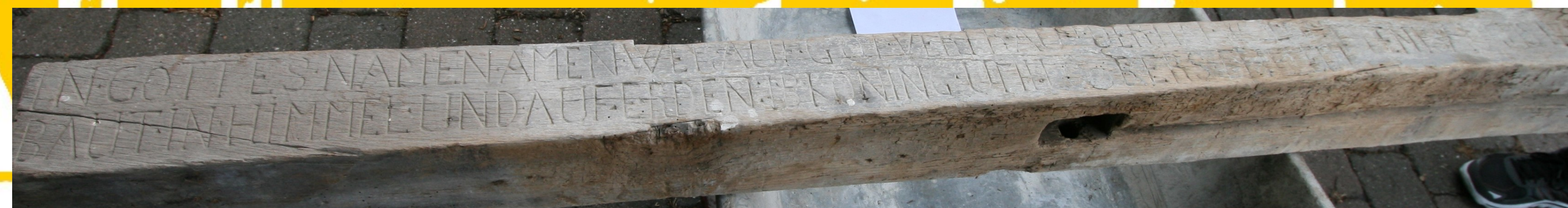
Wooden beam found in the walls of a barn on the König farm. It mentions Elisabeth Klitz König.