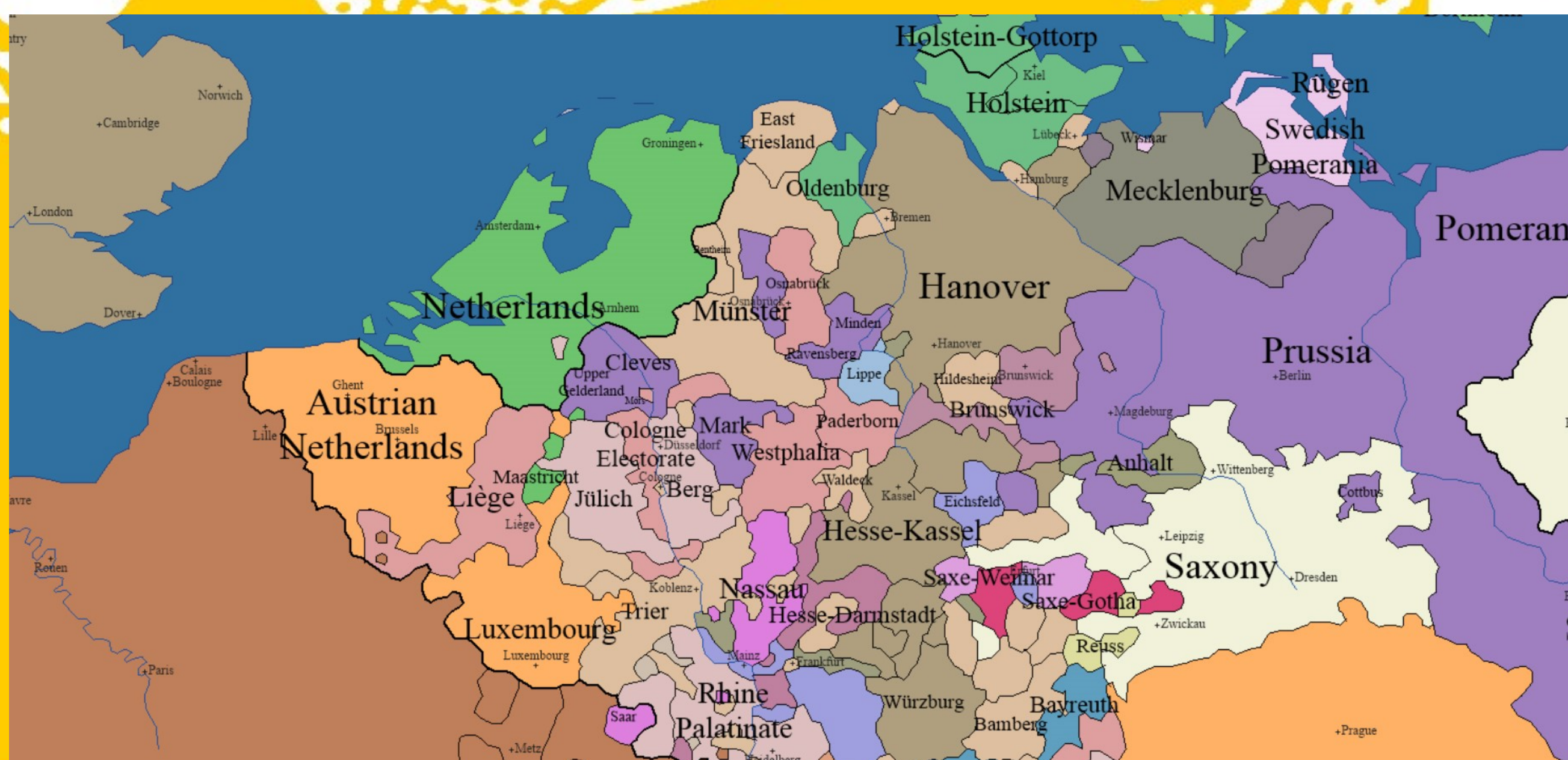
Map of Central Europe, 1743