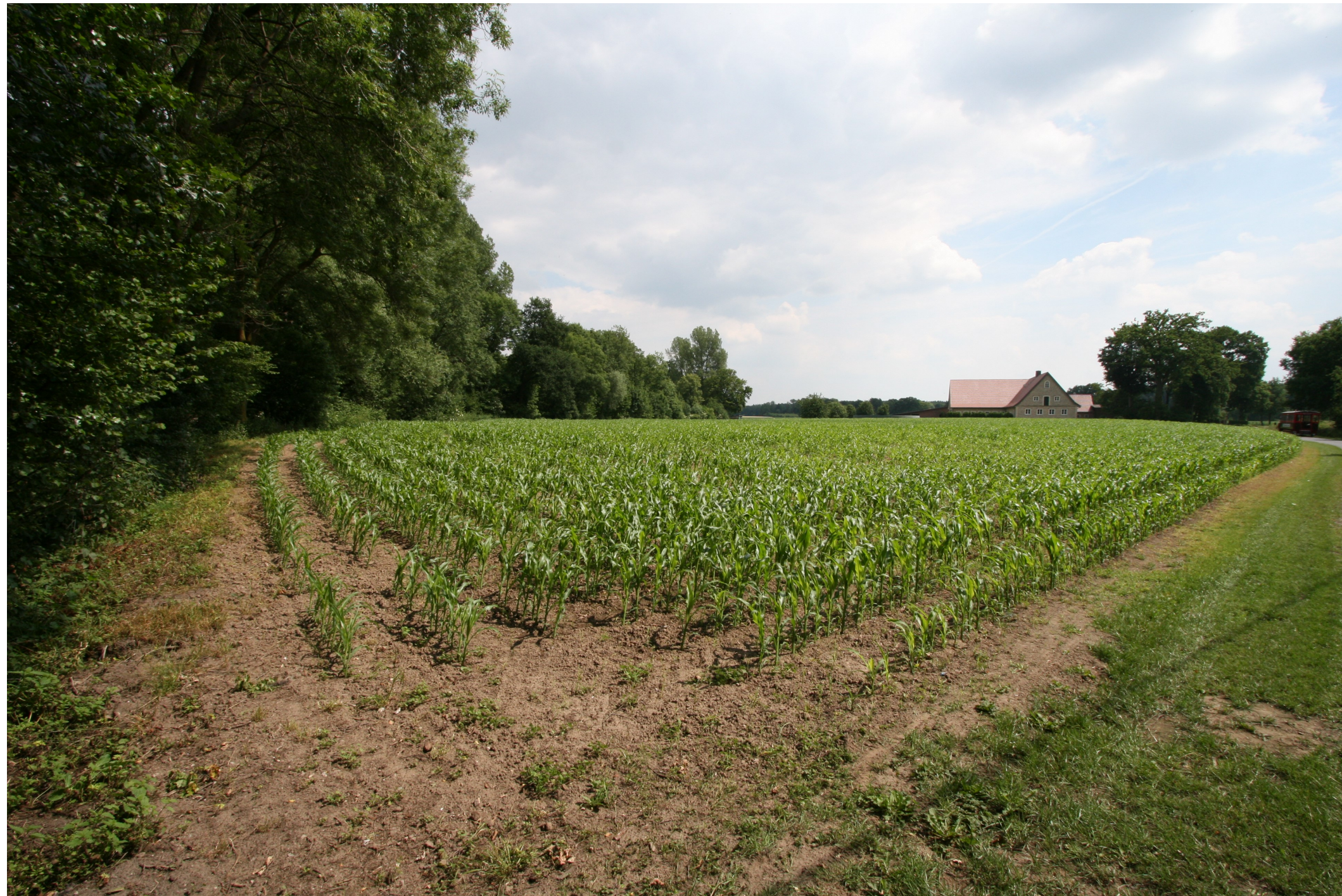
The plot of land the Klitz family lived on for five generations

The tenant farmers of pre-industrial Prussia had few options at their disposal in terms of livelihood and employment. Much like the rest of society, first-born sons could “inherit” the plot of land their parents had worked. (The land still was owned by the upper classes, but tenant farming could pass from generation to generation.)